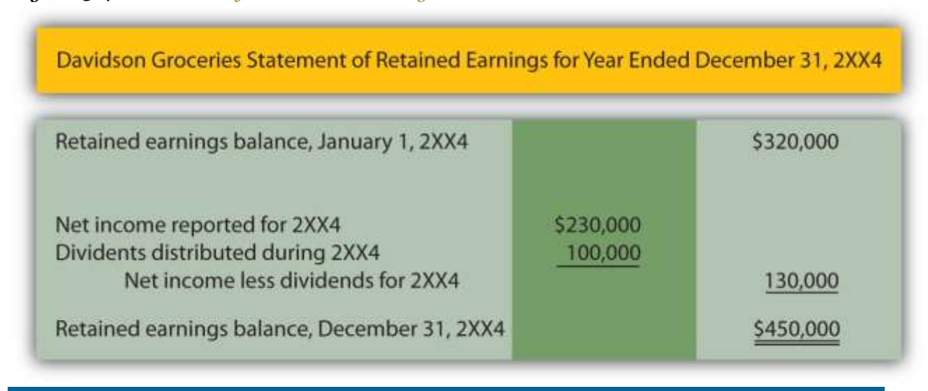
Figure 3.4 Statement of Retained Earnings

Answer: In its three prior years of existence, Davidson Groceries' net assets increased by a total of $320,000 as a result of its operating activities. As can be seen here, the company generated total profit during this period of $530,000 while distributing dividends to shareholders amounting to $210,000, an increase of $320,000. Net assets rose further during the current year (2XX4) as Davidson Groceries made an additional profit (see also ) of $230,000 but distributed $100,000 in dividends. shows the format by which this information is conveyed to the decision makers who are evaluating Davidson Groceries.